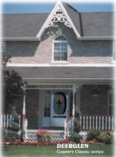
DEERGLLEN Country Classic series

G ive your home a real Victorian charm with our wide range of stylish gingerbread ornaments and planter brackets. Look for them at your nearby home renovation center.